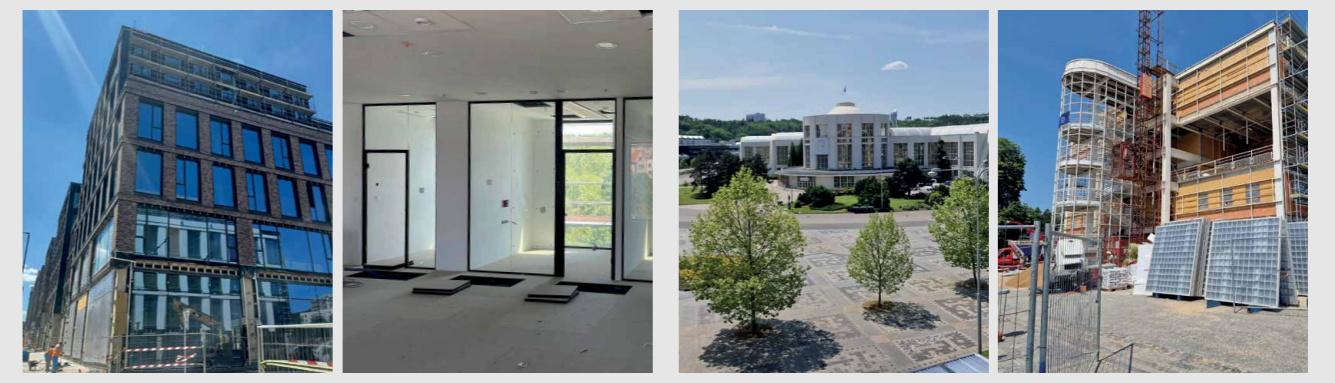
In Prague, in the modern urban district of Nová Waltrovka, we are almost finished. From September, you can find us at this new address.