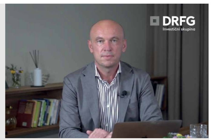
Telecommunications is a perspective domain, which we understand very well. Moreover, it is a sector earning a very interesting yield. .