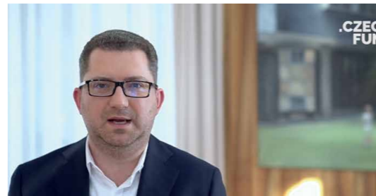
The fundamental strategy of the fund remains the same – to maintain a conservative approach to investments, whereas the non-real estate yield assets should prevail.